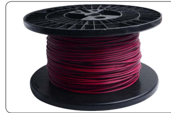
Plastic Spool Packing