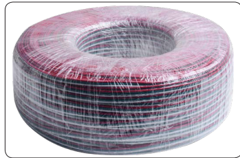
Roll with Film Packing